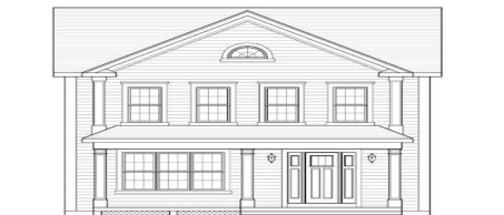
HOUSE FRONT ELEVATION 2390 S.F. ©2024 Global MLS PLUS 1000 S.F. FINISHED BASEMENT