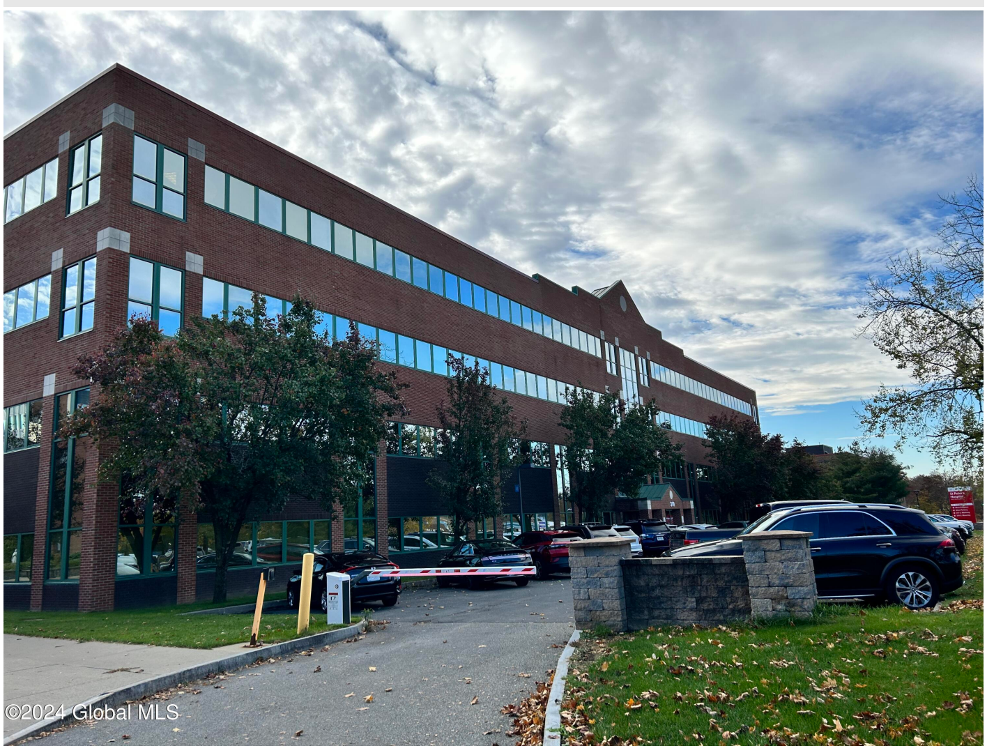
Listing courtesy of: Sterling Real Estate Group

P.O. Box 201, Cleverdale, NY 12820 P: (518) 656-9068 F: (518) 656-9087 www.davies-davies.com