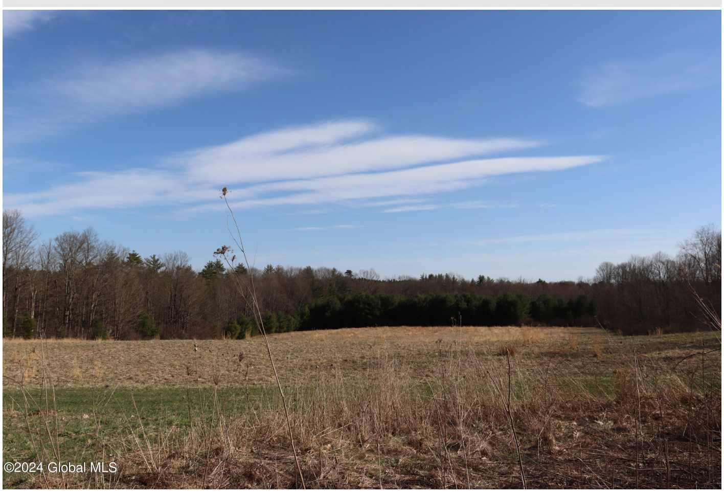
Listing courtesy of: Coldwell Banker Prime Prop.

P.O. Box 201, Cleverdale, NY 12820 P: (518) 656-9068 F: (518) 656-9087 www.davies-davies.com