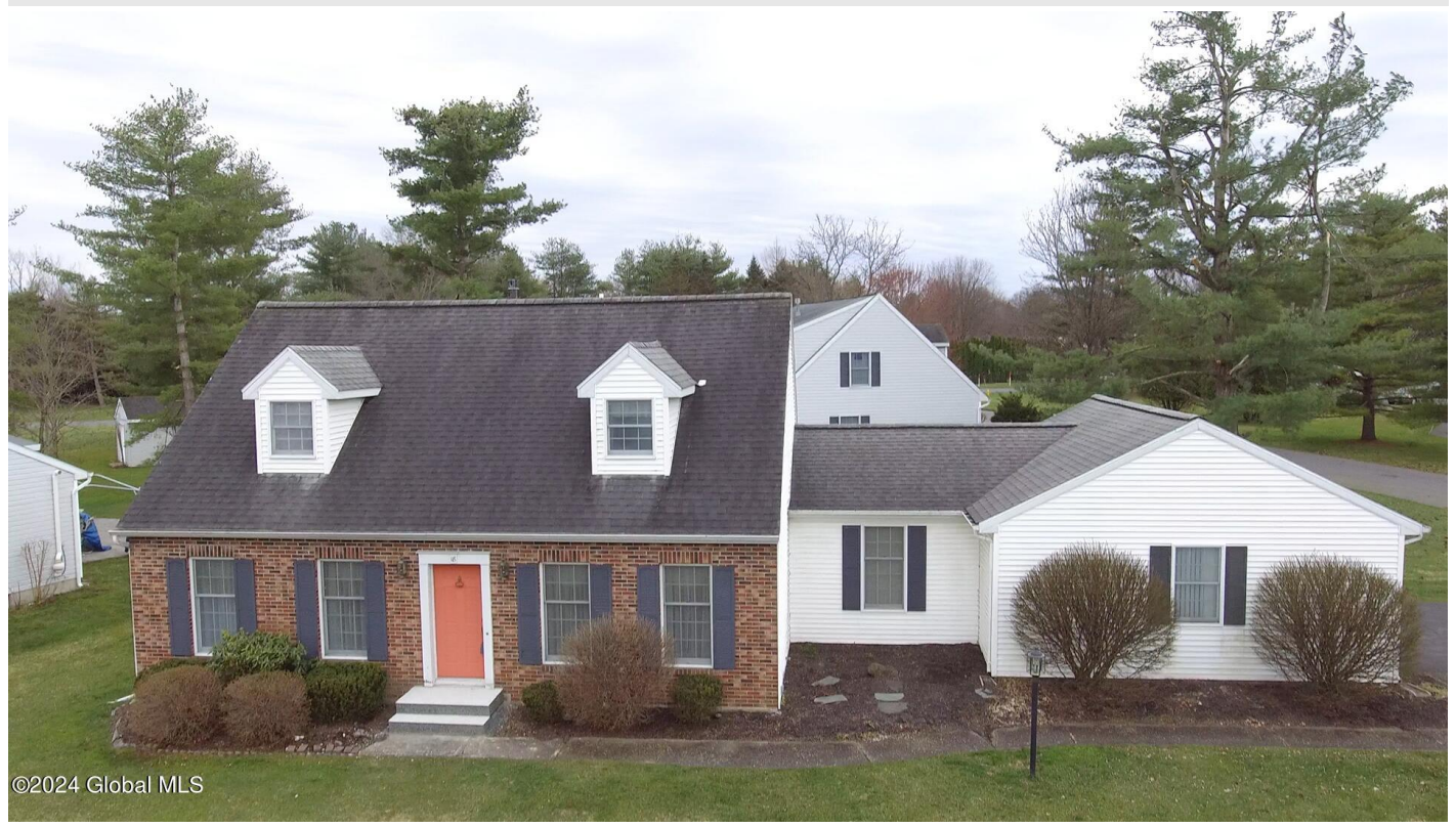
Listing courtesy of: RE/MAX Capital

P.O. Box 201, Cleverdale, NY 12820 P: (518) 656-9068 F: (518) 656-9087 www.davies-davies.com