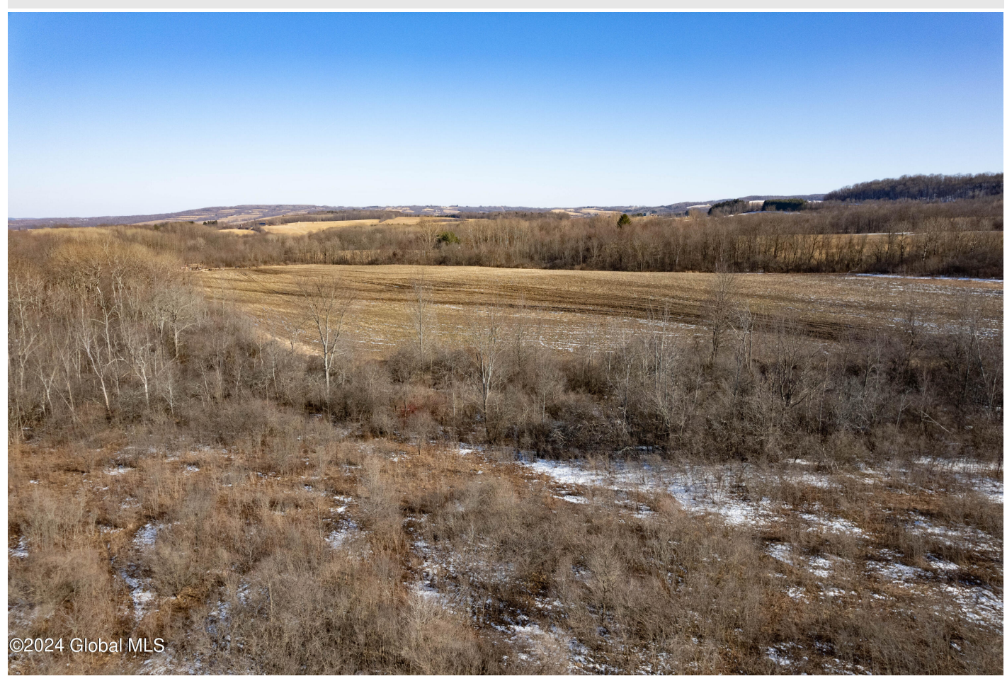
Listing courtesy of: Krutz Properties, LLC

P.O. Box 201, Cleverdale, NY 12820 P: (518) 656-9068 F: (518) 656-9087 www.davies-davies.com