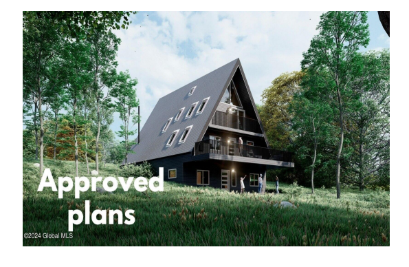
@2024 Global MLS