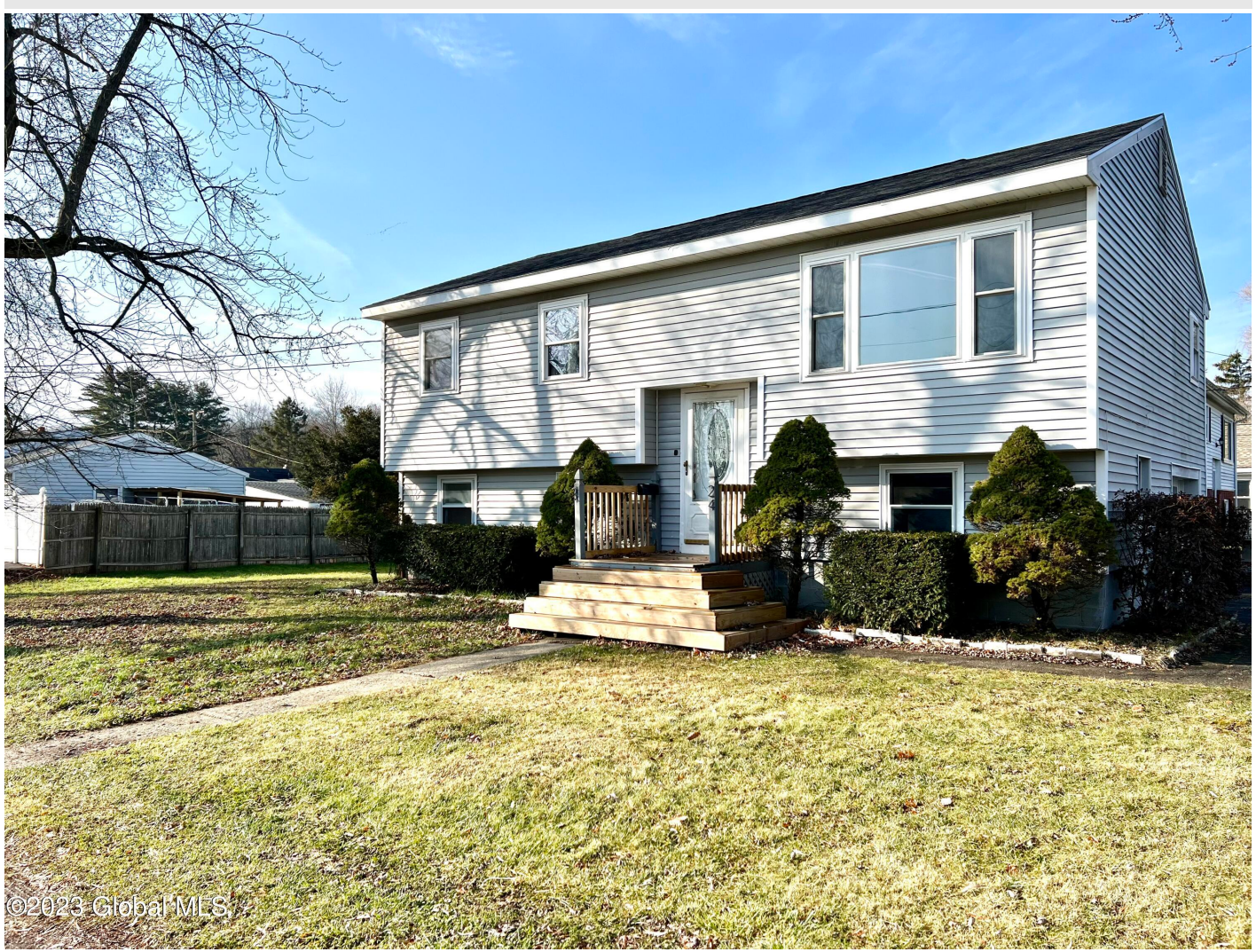
Listing courtesy of: Crystal Coleman Realty LLC

P.O. Box 201, Cleverdale, NY 12820 P: (518) 656-9068 F: (518) 656-9087 www.davies-davies.com