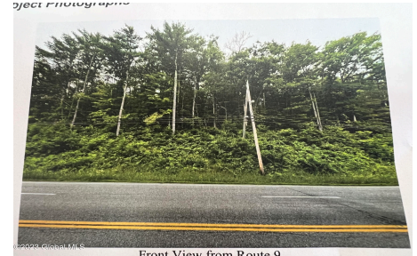
Front View from Route 9