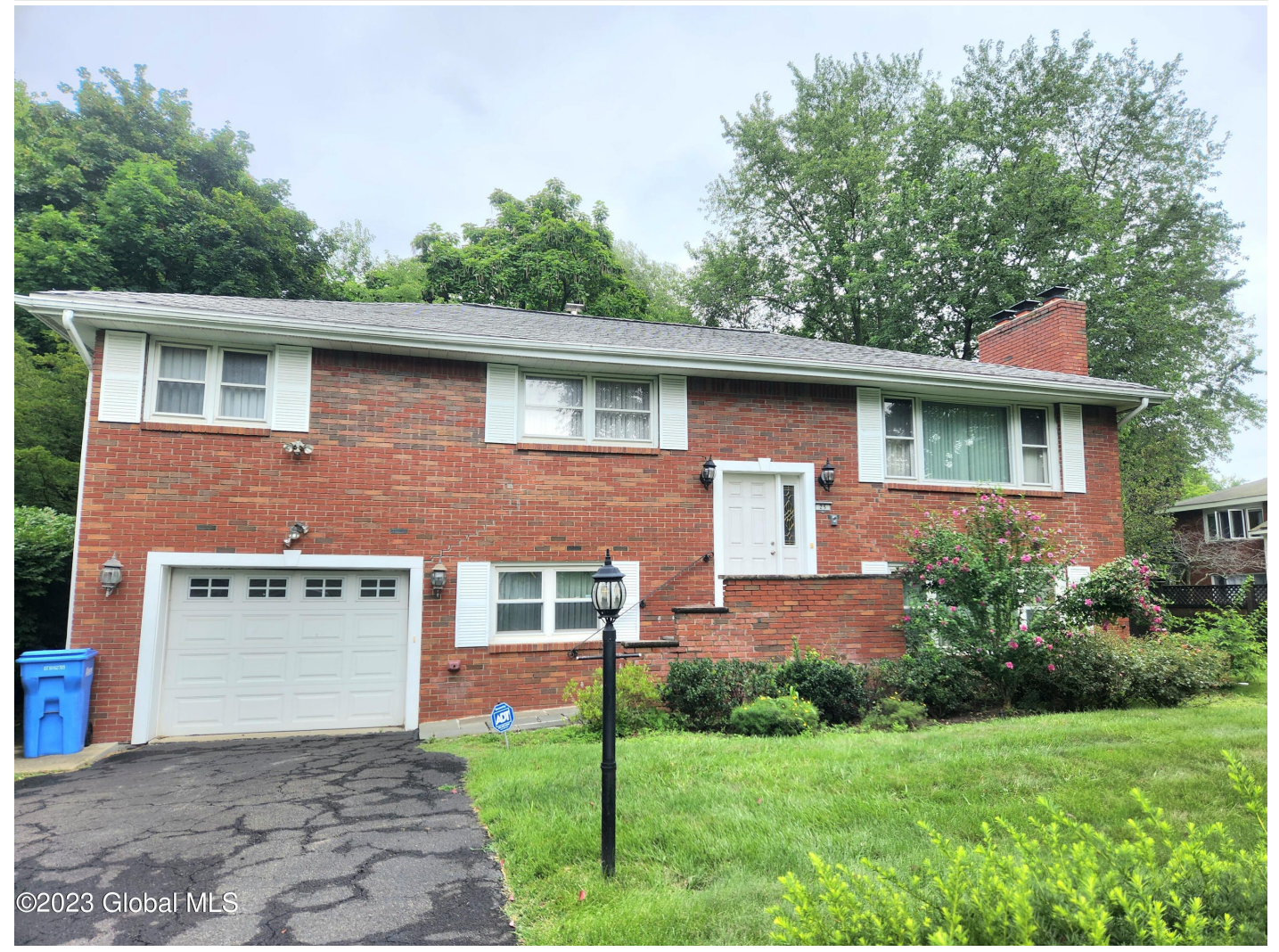
Listing courtesy of: Sterling Real Estate Group

P.O. Box 201, Cleverdale, NY 12820 P: (518) 656-9068 F: (518) 656-9087 www.davies-davies.com