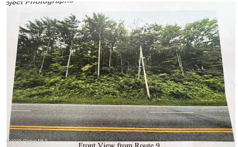
Front View from Route 9