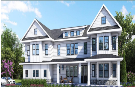
WOOD HOME 20 Aurora Avenue 3 Bedrooms • 4.5 Bath Full Porch 1,840 Sq. Ft. Garage Porch 1,200 Sq. Ft. Total Living Area 4,890 Sq. Ft. Basement 1,200 Sq. Ft. Porch 477 Sq. Ft. Garage 1,200 Sq. Ft. Garage Total 1,200 Sq. Ft.