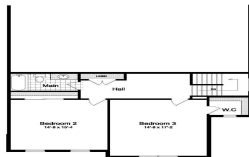
Pine - Second Floor