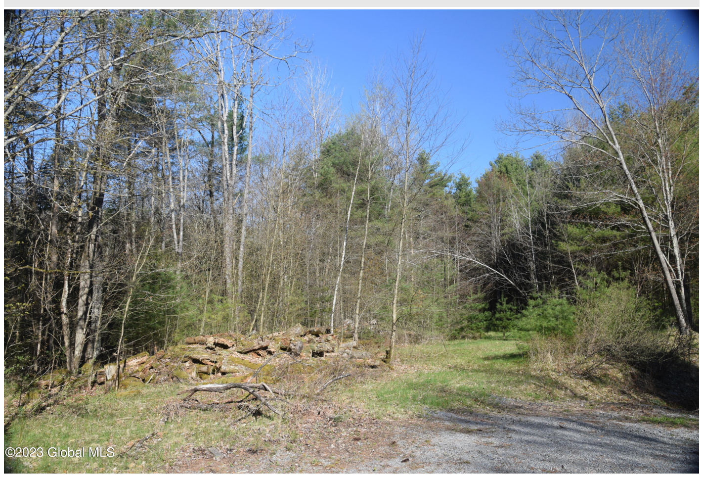
Listing courtesy of: Davies-Davies & Assoc Real Est

P.O. Box 201, Cleverdale, NY 12820 P: (518) 656-9068 F: (518) 656-9087 www.davies-davies.com