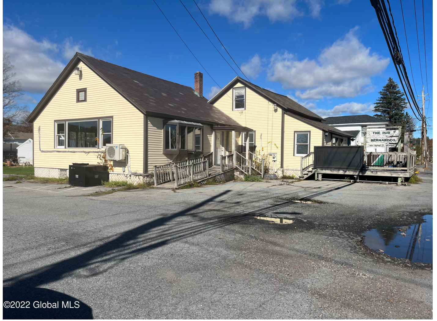
Listing courtesy of: Coldwell Banker Prime Prop.